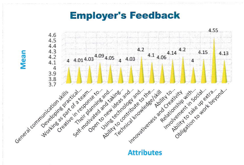
Chart 1: Employers’ Feedback

Furthermore, the following suggestions are provided by the students: