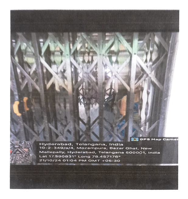
7.1.7 ) Geo-tagged photographs – Lifts for Divyangajans.