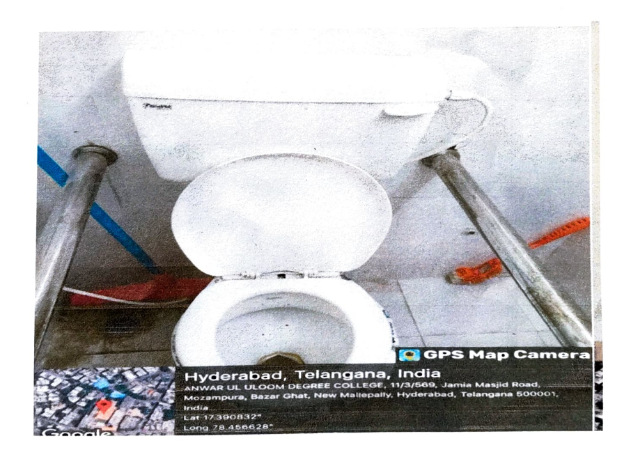
Disabled Friendly Washrooms

Internal Quality Assurance Cell Anwarul Uloom College (Autonomous) New Mallepally, Hyderabad.