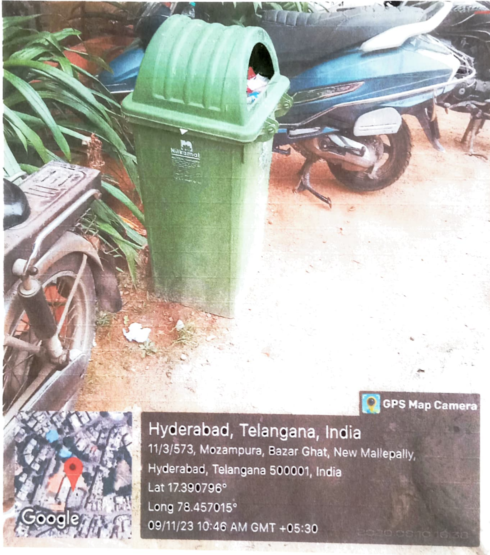
Bins for collection of waste

[Faint signature and text] Internal verification Anwarul Uloom College New Mallepally, Hyderabad