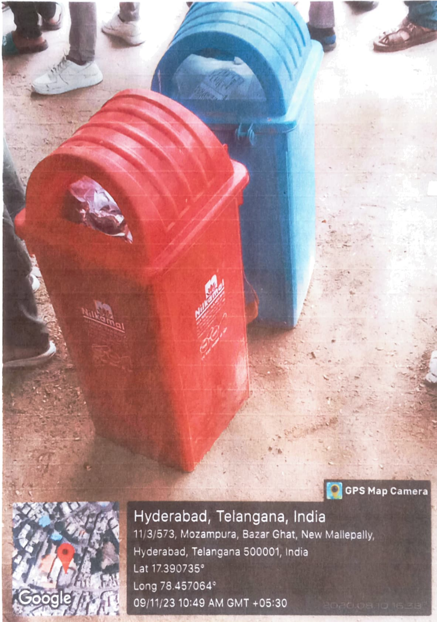
Color-coded Bins for collection of different types of waste

[Signature] COORDINATOR Internal Quality Assurance Cell Anwarul Uloom College (Autonomous) New Mallepally, Hyderabad.